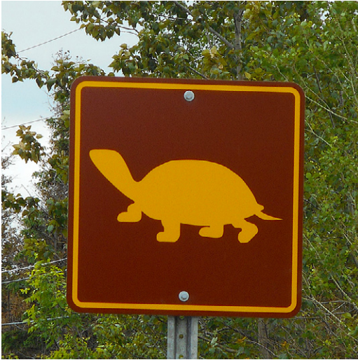
FIGURE 1. Example of turtle sign installed by the Ministry of Transportation along provincial highway 15 in eastern Ontario in May 2018.

annual average daily traffic of 4950 to 9400 vehicles (Ministry of Transportation 2019).