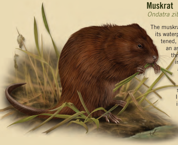
Muskrat Ondatra zibethicus

The least is the smallest chipmunk and has five black dorsal stripes. Active during the day, its chatter-box calls warn everyone of intruders. Its range covers the Yukon and Northwest Territories, and from British Columbia across to western Quebec. Least chipmunks search for the seeds of grasses, sedges, strawberries, raspberries, blueberries, acorns and hazelnuts, which they stuff in their cheek pouches. Over the winter they periodically wake up to feed on seeds stored in their burrow. During the warmer seasons, they also search out prey in the form of grasshoppers, beetles and caterpillars. Their enemies include hawks, weasels and bears. Although generally beneficial, they can cause problems if they feed on cultivated berries. The least chipmunk is one of five chipmunk species found in Canada.