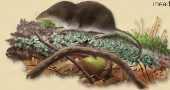
Pygmy Shrew Sorex hoyi

The meadow jumping mouse has long, spindly hind legs, a long, slender tail and large ears. It is solitary, active at night and can bound almost a metre. An excellent swimmer, this jumping mouse can dive deep into the water and also climbs well. It feeds on grass seeds, small fruit and insects. The winter is spent in a deep sleep in underground burrows lined with leaves. Its range includes the Yukon, south-western Northwest Territories and northern British Columbia across to Labrador, Nova Scotia and Prince Edward Island, where it prefers moist grassland along stream banks and the edges of marshes and woodlands. The meadow jumping mouse is prey for owls, hawks, bullfrogs, pike, martens and domestic cats. There are four Canadian species of jumping mice.