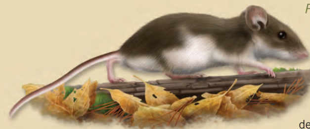
Deer Mouse Peromyscus maniculatus

The snowshoe hare has long, broad hind feet matted with coarse hair, facilitating travel in deep snow. Its coat turns white in winter. Active at night, the snowshoe hare spends its days in the shelter of shrubs, stumps or logs. Found across Canada, the snowshoe hare was also introduced to Newfoundland. It inhabits swamps, river thickets and forests. It can bound up to three metres, hit speeds of over 40 kilometres per hour and will take to water to escape predators. Snowshoe hares eat grasses and leaves in summer and the buds, twigs and evergreen leaves of woody plants in winter. It is the main food of lynx and important prey for bobcats, red foxes and wolves. It is one of four Canadian hare species.