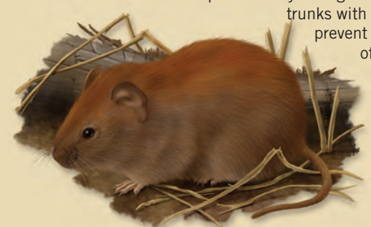
Gapper's Red-backed Vole Clethrionomys gapperi

Gapper's is found in forests and bushy areas, mostly near water. Its range extends across the country. Logs, stumps and brush provide safe cover while it forages for leaves, berries and seeds. In winter, it congregates in family groups and feeds on the buds and bark of trees. They nest in tree cavities, abandoned burrows, brush piles or under logs. Voles are important food for many predators, including great gray and barn owls, American kestrel, red-tailed hawk, weasels and mink. In some areas, the Gapper's vole causes problems by eating the bark of small trees – wrapping trunks with tar paper or metal collars helps prevent damage. The Gapper's vole is one of 17 vole species found in Canada, including the woodland vole, a species of special concern.