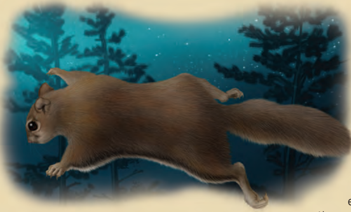
Northern Flying Squirrel Glaucomys sabrinus

The northern flying squirrel is found across Canada except in Newfoundland. Its large eyes allow it to see better at night when it is active. Flying squirrels can glide long distances thanks to an elastic flight membrane between their front and back legs that becomes taut when extended. By adjusting the tension on these membranes and maneuvering their tails, they can change direction and reduce speed for a smooth landing. Their diet consists mainly of lichens, fungi, and the buds and seeds of trees such as beech, aspen, maple and oak. Their predators include weasels, bobcats, fishers and domestic cats. They are an important part of the diet of owls, especially the endangered northern spotted owl. There are two species of flying squirrels in Canada.