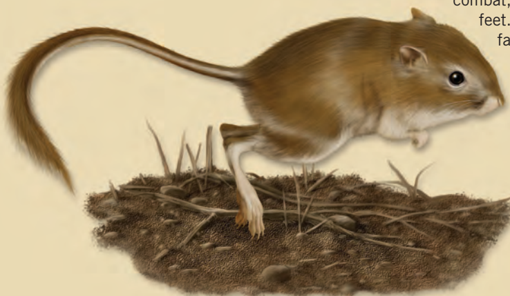
Ord's Kangaroo Rat Dipodomys ordii

The northern flying squirrel is found across Canada except in Newfoundland. Its large eyes allow it to see better at night when it is active. Flying squirrels can glide long distances thanks to an elastic flight membrane between their front and back legs that becomes taut when extended. By adjusting the tension on these membranes and maneuvering their tails, they can change direction and reduce speed for a smooth landing. Their diet consists mainly of lichens, fungi, and the buds and seeds of trees such as beech, aspen, maple and oak. Their predators include weasels, bobcats, fishers and domestic cats. They are an important part of the diet of owls, especially the endangered northern spotted owl. There are two species of flying squirrels in Canada.