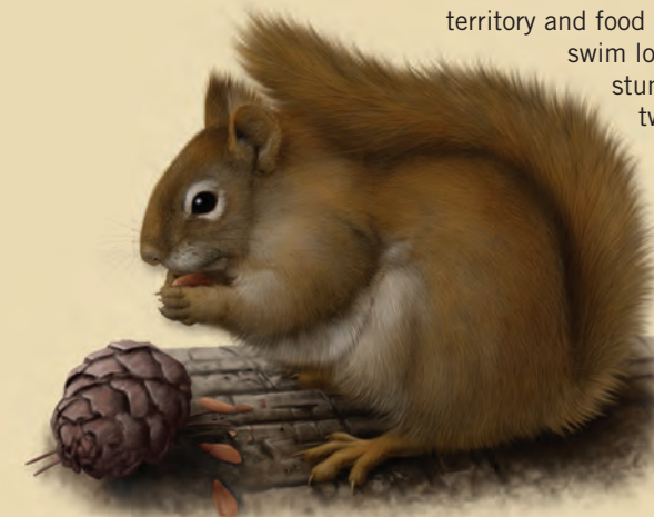
American Red Squirrel Tamiasciurus hudsonicus

Considered a living fossil, the mountain beaver has the muscle and jaw structure of the most primitive rodents. It is not actually a beaver, but resembles a stubby-tailed muskrat with a stout body, short legs and long whiskers. It occurs in the Cascade Mountains of British Columbia. The mountain beaver digs burrows that can extend more than 40 metres and has many entrances hidden among ground cover. The mountain beaver spends day and night alternating between resting and foraging. It dries grasses and ferns in the sun at its burrow's entrance and stores them for winter. The mountain beaver falls prey to ermine, cougars and other predators. This is the only species of mountain beaver and it is considered a species of special concern.