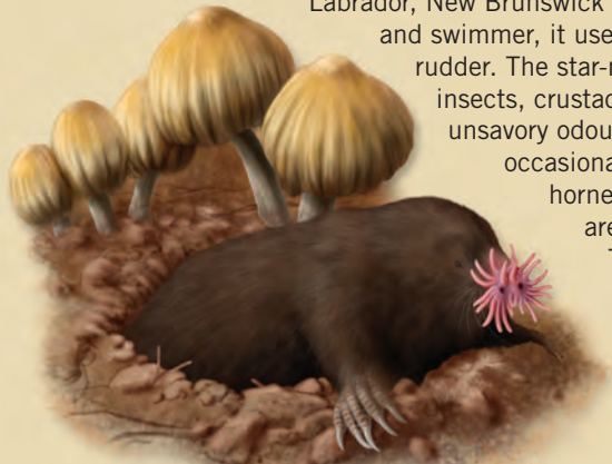
Star-nosed Mole Condylura cristata

The northern pocket gopher has fur-lined cheek pouches that open to the side of the face instead of into the mouth as squirrel's pouches do. It is active year-round and solitary. It burrows under plants, such as dandelions or dogtooth violets, and pulls them from below. The northern pocket gopher cuts plants up, uses its forepaws to stuff them into its cheek pouches and brings them to its burrow for storage. It is found in the grasslands, roadsides and riverbanks of Manitoba, Saskatchewan, Alberta and British Columbia. It contributes to grassland ecology by keeping the soil aerated, though it can create problems in agricultural areas and gardens. Pocket gophers are prey for owls, badger, long-tailed weasel and other predators. The plains pocket gopher in southern Manitoba is another Canadian species.