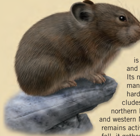
American Pika Ochotona princeps

One of Canada's smallest rodents, the olive-backed pocket mouse has large hind feet and small forefeet. It lives in loose sandy soil on the arid grasslands of southern Manitoba, Saskatchewan and Alberta. It is a solitary, nocturnal creature that moves slowly using all four feet or at a gallop with its strong hind legs propelling it distances of over one metre. The olive-backed pocket mouse uses its forepaws to dig, propelling sand backwards with the kicks of its hind feet. While burrows created in the summer are shallow, winter burrows can descend two metres into the ground. The olive-backed pocket mouse has adapted to the seasonally restricted food supplies of semi-desert conditions by becoming drowsy and sluggish when food is limited. It feeds on grass seeds and insects and can go long periods without water. During winter it remains in its burrow, partially dormant and consuming stored food. Predators of pocket mice include rattlesnakes, burrowing owls, badgers, the swift fox and bobcats. The great basin pocket mouse is Canada's only other species.