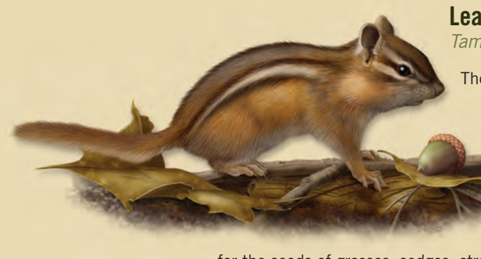
Least Chipmunk Tamias minimus

Ord's kangaroo rat is nocturnal, solitary and aggressively defends its burrow and stored food. It engages in aerial combat, leaping into the air and slashing with its hind feet. Ord's kangaroo rats will also kick sand in the face of predators, including rattlesnakes. It uses its hind legs to propel itself distances of over two metres and uses its tail for balance. Ord's kangaroo rats are known to take sand baths to keep their fur clean. They feed on small seeds and insects, gathering food with their forepaws and packing it in their cheek pouches. Ord's kangaroo rats are only found in southwestern Saskatchewan and south-eastern Alberta. Predators include long-eared and barn owls, badgers and foxes. Ord's is Canada's only species of kangaroo rat and is considered endangered.