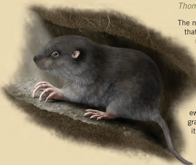
Northern Pocket Gopher Thomomys talpoides

The northern pocket gopher has fur-lined cheek pouches that open to the side of the face instead of into the mouth as squirrel's pouches do. It is active year-round and solitary. It burrows under plants, such as dandelions or dogtooth violets, and pulls them from below. The northern pocket gopher cuts plants up, uses its forepaws to stuff them into its cheek pouches and brings them to its burrow for storage. It is found in the grasslands, roadsides and riverbanks of Manitoba, Saskatchewan, Alberta and British Columbia. It contributes to grassland ecology by keeping the soil aerated, though it can create problems in agricultural areas and gardens. Pocket gophers are prey for owls, badger, long-tailed weasel and other predators. The plains pocket gopher in southern Manitoba is another Canadian species.