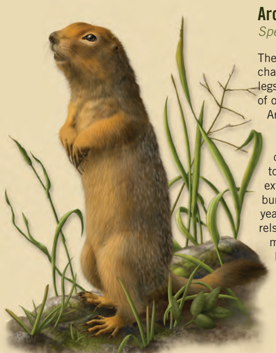
Arctic Ground Squirrel Spermophilus parryi

The American pika has rounded ears, no visible tail and resembles a guinea pig. It is active during the day, solitary and loves to sun on prominent rocks. Its nasal bleat appears to come from many different directions, making it hard to locate. The pika's habitat includes rocky slopes in the mountains of northern British Columbia, southern Yukon and western Northwest Territories, where it remains active all winter. In late summer and fall, it gathers grasses, sedges, tender shoots of shrubs and flowering plants, spreading them in the sun to dry and then piling them in stacks under overhanging rocks. It falls prey to a number of birds and mammals, including martens and ermine. The collared pika, also found in northwestern Canada, is our only other pika species.