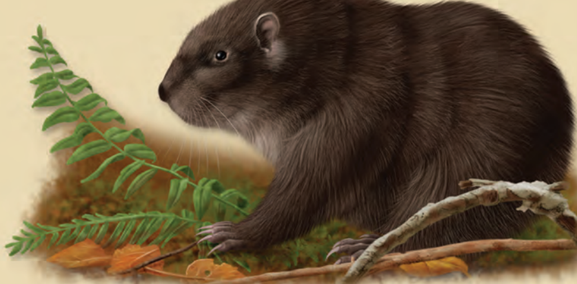
Mountain Beaver Apelodontia rufa

The star-nosed mole has 22 pink tentacles at the tip of its nose, which provide information on its surroundings. It lives in groups and is active day and night year-round. Its range includes Ontario, Quebec, Labrador, New Brunswick and Nova Scotia. An excellent diver and swimmer, it uses its forefeet as paddles and tail as a rudder. The star-nosed mole feeds on aquatic worms, insects, crustaceans and small land animals. Its unsavory odour protects it from predators, though it occasionally falls prey to fish, hawks and great-horned owls. Since it normally lives in wet areas, it rarely conflicts with humans. There are six mole species in Canada, including the endangered Townsend's mole of British Columbia and the eastern mole of southwestern Ontario, a species of special concern.