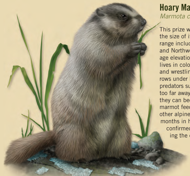
Hoary Marmot Marmota caligata

Gapper's is found in forests and bushy areas, mostly near water. Its range extends across the country. Logs, stumps and brush provide safe cover while it forages for leaves, berries and seeds. In winter, it congregates in family groups and feeds on the buds and bark of trees. They nest in tree cavities, abandoned burrows, brush piles or under logs. Voles are important food for many predators, including great gray and barn owls, American kestrel, red-tailed hawk, weasels and mink. In some areas, the Gapper's vole causes problems by eating the bark of small trees – wrapping trunks with tar paper or metal collars helps prevent damage. The Gapper's vole is one of 17 vole species found in Canada, including the woodland vole, a species of special concern.