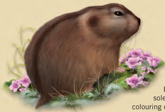
Northern Collared Lemming Dicrostonyx groenlandicus

The muskrat spends most of its life in water, where its waterproof fur, paddle-like hind feet and flattened, furless tail, which it uses as a rudder, are an asset. It can remain under water for over three minutes. Bulrushes and cattails are important to muskrats – for building shelter and as their favoured food. They also feed on arrowhead, pondweeds, sedges and other plants and will prey on frogs, insects, snails and fish when plants are limited. In winter it builds "push ups" by chewing through the ice and creating a cover of frozen vegetation to use as feeding and resting stations. Muskrats create valuable open water habitat and are an important food source for owls, pike, mink, wolves and foxes. Found across Canada, it is our only species.