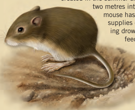
Olive-backed Pocket Mouse Perognathus fasciatus

This prize whistler is our largest marmot, twice the size of its cousin the common groundhog. Its range includes Alberta, British Columbia, Yukon and Northwest Territories, where it lives at an average elevation of 2000 metres. The hoary marmot lives in colonies and enjoys greeting, grooming and wrestling with its neighbours. They build burrow-like boulders to gain protection from large predators such as grizzly bears. If they wander too far away from their burrow in search of food, they can become prey to golden eagles. The hoary marmot feeds on grasses, sedges, berries and other alpine vegetation, and spends up to eight months in hibernation. The hoary is one of four confirmed species of marmot in Canada, including the endangered Vancouver Island marmot.