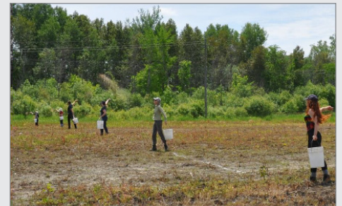
Figure 2: Walk lines 10 metres apart to hand broadcast seed. Fling seed every five steps.