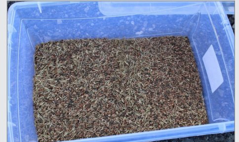
Figure 1: Divide seed mix evenly into separate containers for each section of the site.