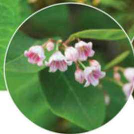
Spreading Dogbane ( Apocynum androsaemifolium )