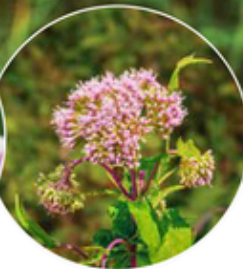
Joe Pye weed ( Eutrochium maculatum ).

Common Name: Common Milkweed Scientific Name: Asclepias syriaca